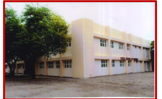
Excel School of Nursing