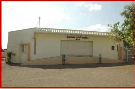
Shree Krushnalala H. Sanghvi Balmandir