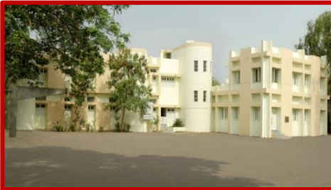
Shree and Smt.C.R.Bhatt Centre Bhavnagar Jewelry Training Institute